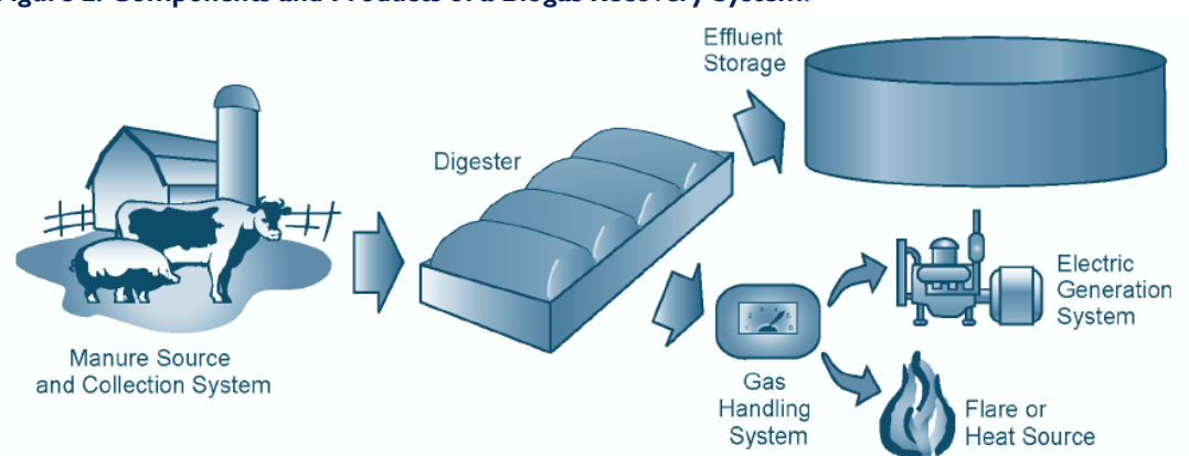
Figure 2: Components and Products of a Biogas Recovery System.

In agriculture, animal and crop wastes are typically used as a feedstock for anaerobic digesters. Domestically, there are about 162 agricultural anaerobic digester systems. They collectively produced approximately 453,000 megawatt-hours (MWh) of energy in 2010, enough to power 25,000 average U.S. homes.<sup>8</sup> Different types of digesters are used depending on the existing waste management system for a given farm.