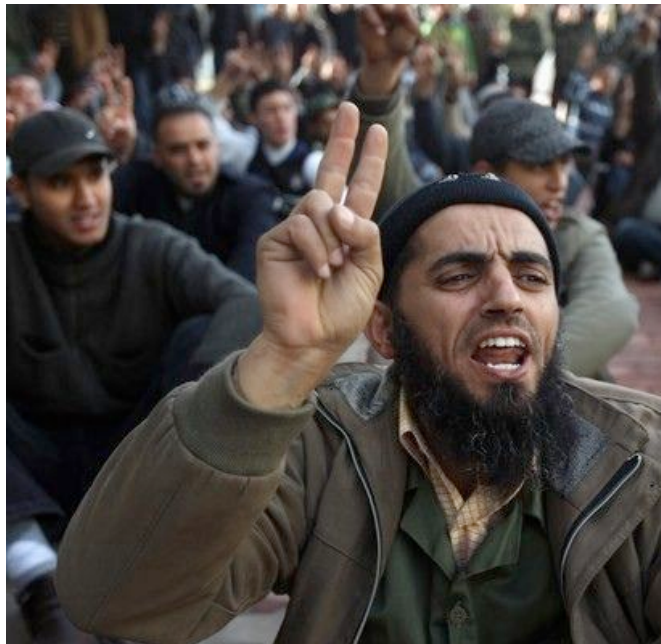
A group of civilian rebel volunteers gathers for its first day of military training in Benghazi, Libya

Until the outbreak of hostilities, the U.S. imported 51,000 barrels per day of oil from Libya, 13 meaning that U.S. money directly propped up Gaddafi's corrupt and tyrannical rule, and later funded his inhumane war methods. And since oil is a global commodity, by continuing to consume it, we continue to drive up its price, allocating power to abusive dictators like Gaddafi.