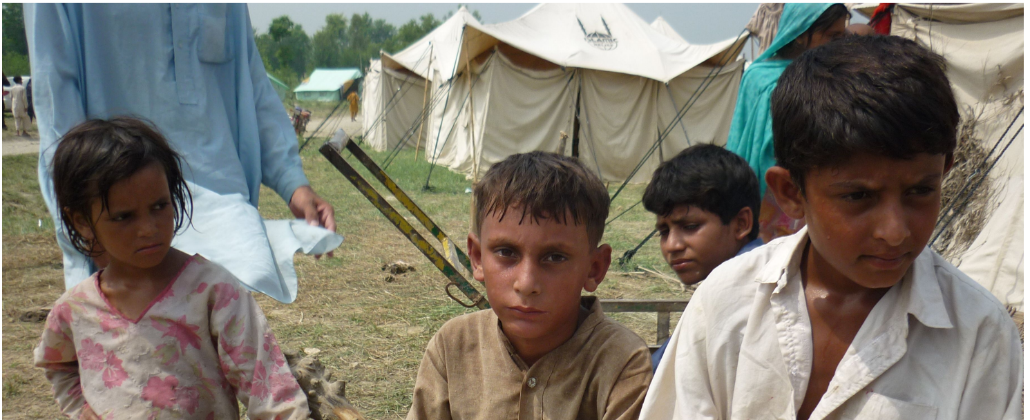
Refugee children in Pakistan following the 2010 floods.

disasters have profound impacts upon the health, agriculture, and economy of developing and emerging nations.