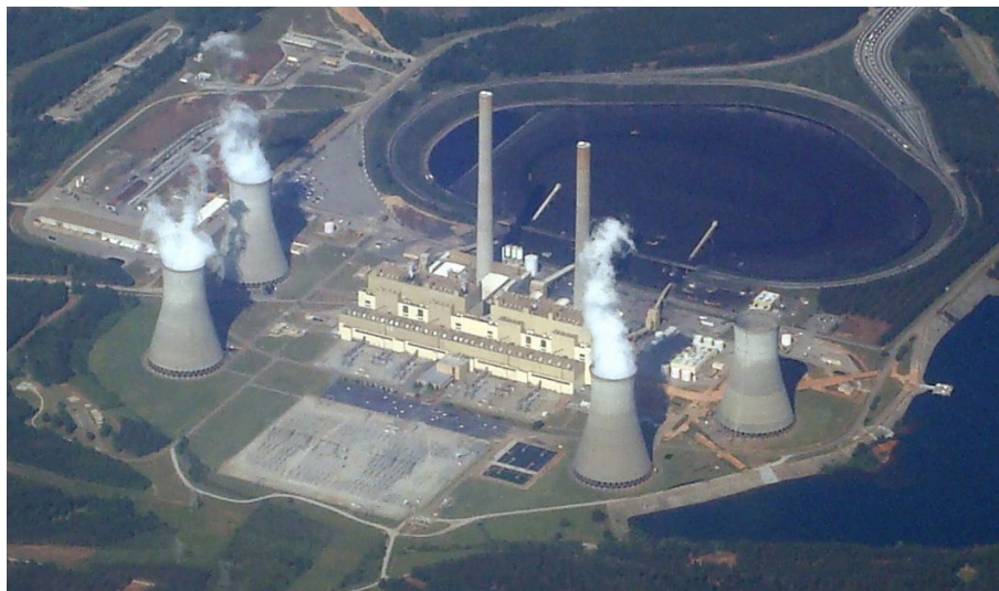
Aerial View of the Scherer Plant

When we can grasp the connection between local coal plant pollution and the strife brought by changes in global climate, it becomes even more alarmingly clear that we need to transition away from such dangerous and deadly energy sources. In the mean time, perhaps it is enough to consider the sickness and death suffered by the children, senior citizens, and all residents of towns like Juliette, those communities that suffer the worst of the direct effects of coal burning.