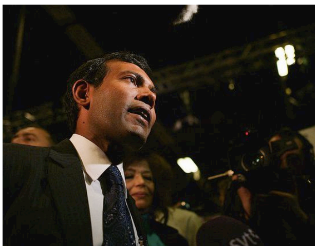
President Mohamed Nasheed of the Maldives

To save their paradise from extinction, Maldivians are treating environmental science with the same emphasis as math and writing, and are teaching it in every school. And in case they fail to stop the rising seas, the Maldivians are planning for the worst — 300,000 residents becoming refugees — by setting aside some of the revenue from its lucrative tourist industry to buy a new homeland. 100 Already, Maldivian residents have abandoned 16 islands due to rising sea levels. Maldivian citizens are split: most are reluctant to leave the submerging islands and seek life elsewhere, but none wish to wait too long to leave, only to see their future generations living as nationless refugees.