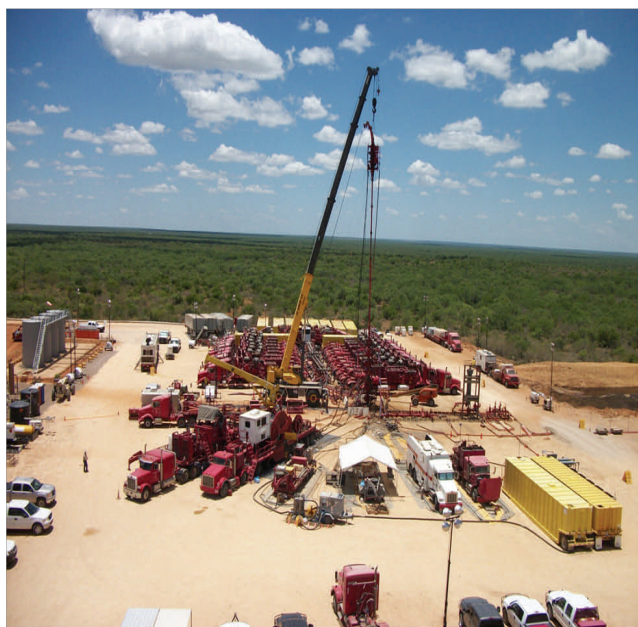
PICTURE 1. FRACKING SITE