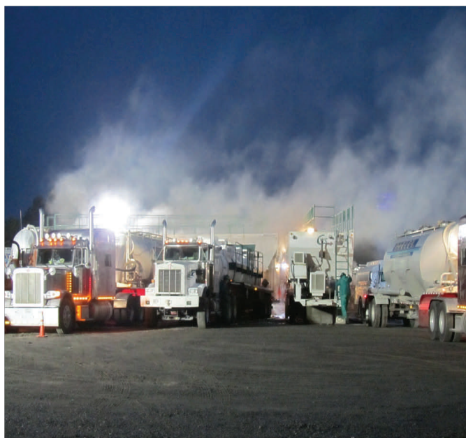
PICTURE 2. TRUCKS HOT LOADING WATER MIXTURE AT A FRACKING SITE