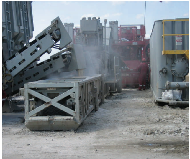
PICTURE 3. CLOUD OF SILICA DUST FROM SAND TRANSFER AT A FRACKING SITE

Oil and gas drilling sites have previously been recognized as having safety and health hazards with the risk increased by fatigue from working long shifts, poor lighting and working in temperature extremes. Previously recognized risks included noise, exposure to diesel exhaust from the large number of trucks, being struck by a motor vehicle, falls from heights, being caught in or struck by equipment including drilling equipment or high pressure lines, fires or explosions and working inside confined sand storage or frack tanks ( http://www.osha.gov/dts/hazardalerts/hydraulic_frac_hazard_alert.html ).