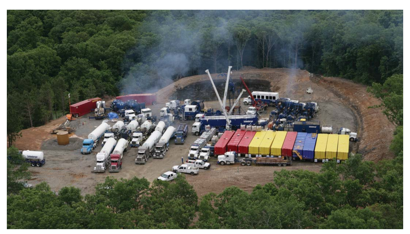
Schlumberger crews are performing one of four stages in a nitrogen-foam fracture stimulation on Southwestern Energy's McNew No. 3-2H horizontal well in Conway County.

As of the end of October, Southwestern had upped its total well count to 66, plus one outside-operated well, and was producing 12 million cubic feet a day from the play. The