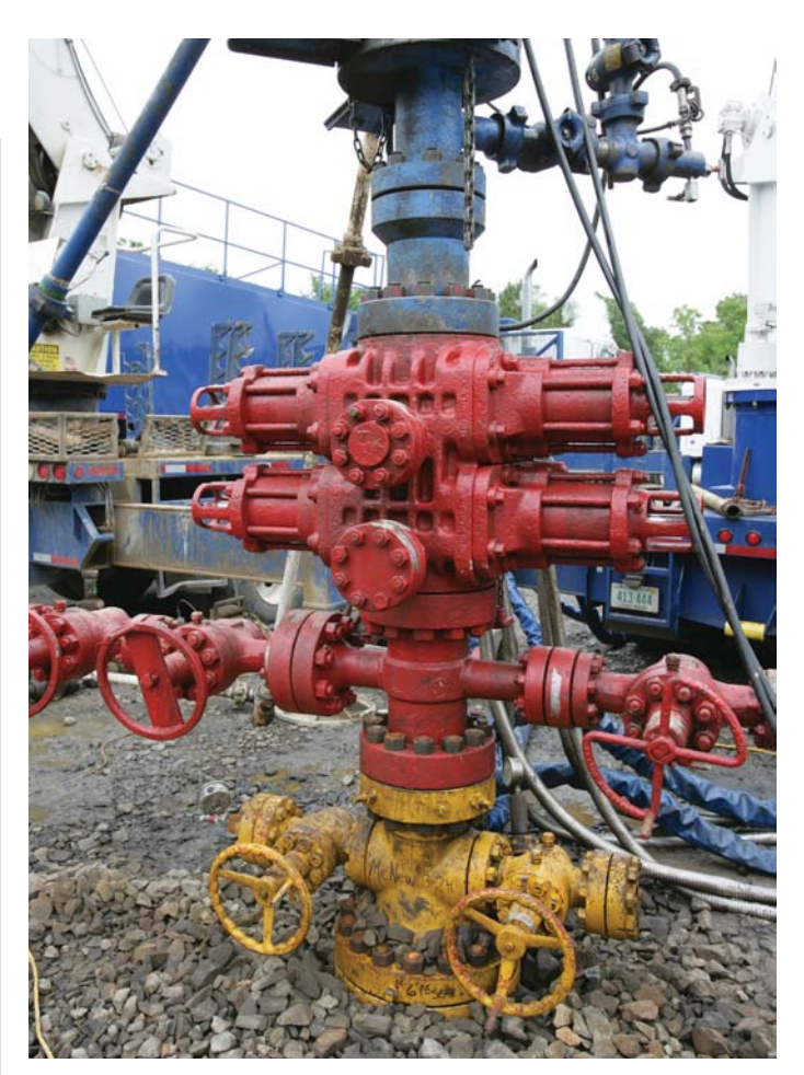
Southwestern Energy's McNew No. 32-H is rigged for a nitrogen-foam fracture treatment. The well, in proposed Gravel Hill Field, has a 2,310-foot lateral.

New York • Hartford • Houston • Tulsa • Dallas • Calgary