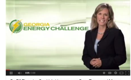
On-Bill-Financing Can Help Homeowners Save Energy and Money

Watch a three-minute video of the Georgia Environmental Facilities Authority (the Georgia State Energy Office) discussing the Residential On-Bill Financing Program available as part of the Georgia Energy Challenge at http://youtu.be/ypXYZPWN7rw .