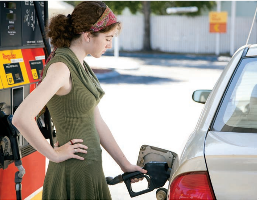
Today, consumers can choose from a wide array of cars and trucks that save money at the pump. Indeed, 10 percent of vehicles sold in 2015 will meet fuel economy and global warming emissions standards for 2020 and beyond, thanks to automakers employing efficient technologies across their fleets.

Already, automakers are demonstrating that they have the technology to not only meet these standards, but also exceed them. Today, consumers have a greater number of fuel-efficient, lower-emission choices across all vehicle classes, and these vehicles can save drivers thousands of dollars at the pump compared with vehicles sold just a few years ago. Ten percent of new vehicles sold today already meet the regulatory targets for 2020 and beyond. Automakers are well positioned to meet requirements over the next 10 years by expanding the use of fuel-saving and emissions-cutting technologies across their fleets.