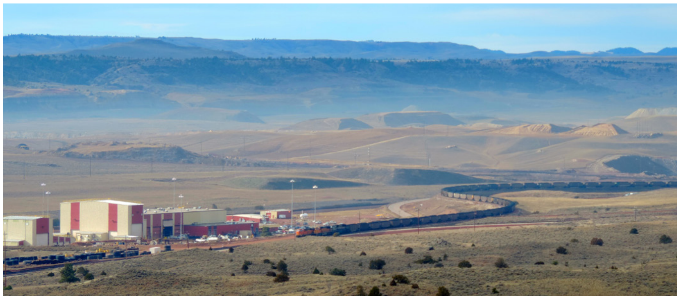
Freight train carrying multiple cars filled with coal.

Interior has reasonable latitude to adjust individual royalty rates based on these factors, or to develop regional or national estimates that are applied more generally. Either approach would improve the agency's ability to secure a more socially optimal return from coal mining on public lands.