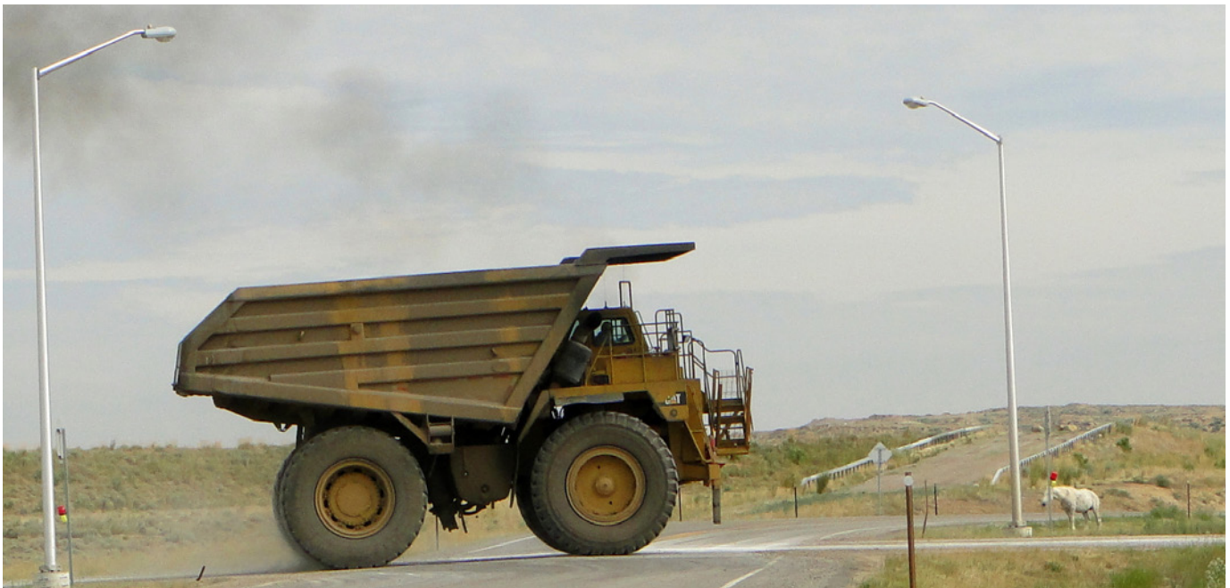
Coal hauler at the Jim Bridger Power Plant near Point of Rocks, Wyoming.

There is also evidence of companies engaging in captive transactions, or non-arm's length transactions, to sell coal to their own subsidiary companies or affiliates at depressed prices and then reporting these sales as arm's length in order to pay a lower royalty. 84 A 2012 Reuters report found that captive transactions allowed companies to retain an additional $40 million in coal exports from Wyoming and Montana in 2011. 85 These issues led Interior's Office of Natural Resources Revenue to propose a new rule in January 2015, to clarify the definition of arm's length transactions and give the agency more authority to police this practice. However, Interior can do more to ensure a fair return. As