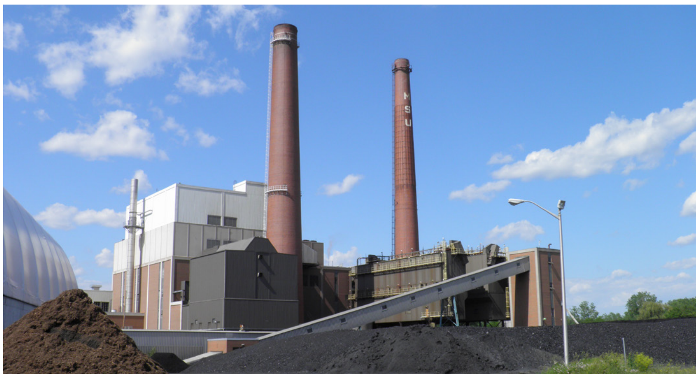
T. B. Simon Power Plant at Michigan State University. The plant provides electricity, heating, cooling, and water to the East Lansing campus. Its primary fuel is coal.

BLM should also examine how to conduct more long-term strategic planning, as BOEM does; for example, it should consider reinstating the Powder River Basin’s status as a “coal production region.” 126