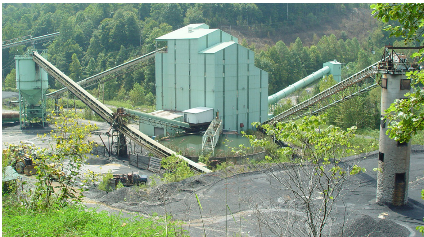
A coal washer located in Clay County in Eastern Kentucky.

to end users (such as power plants) or to find the most efficient means of transport. As a result, these subsidies increase reliance on fossil fuels, and mask their true social costs. 147 If Interior decides to preserve the transportation allowance, it should cap it and take steps to encourage efficient transportation, for example, by using a publicly available index of transportation costs to calculate the allowance, rather than relying on company-reported costs.