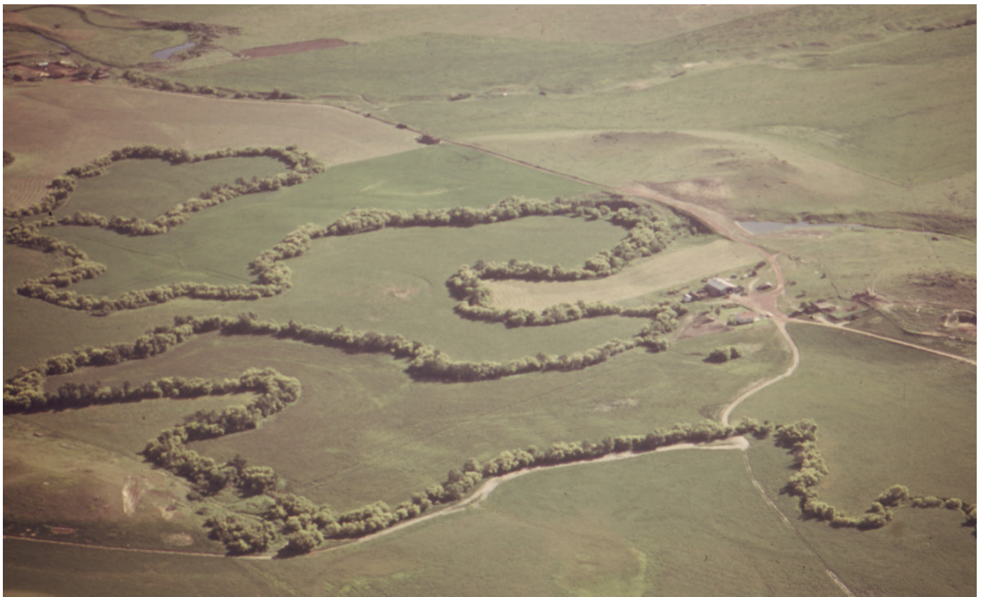
An aerial view of land in the Powder River Basin from 1973, before the region was heavily disturbed by coal mining.

Read together, the Federal Land Policy and Management Act, Mineral Leasing Act, and Federal Coal Leasing Amendments Act instruct Interior to harmonize the need for domestic mineral production with long-term