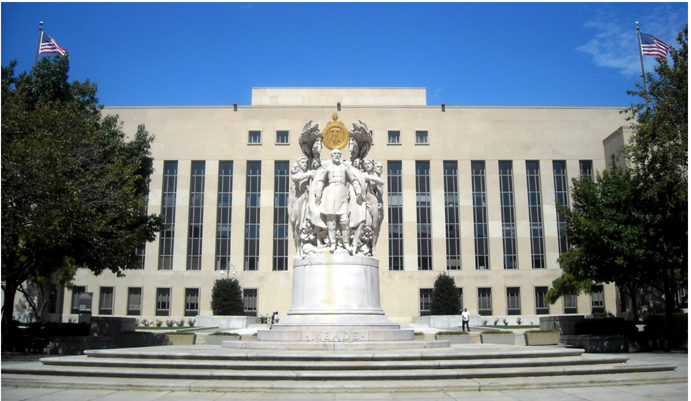
E. Barrett Prettyman Federal Courthouse, United States Court of Appeals for the District of Columbia Circuit

Ultimately, the Court found that BOEM’s failure to quantify option value was not arbitrary or irrational at this time because the methodology for quantifying option value is not yet “sufficiently established.” 50 But importantly, the Court noted: “Had the path been well worn, it might have been irrational for Interior not to follow it.” 51