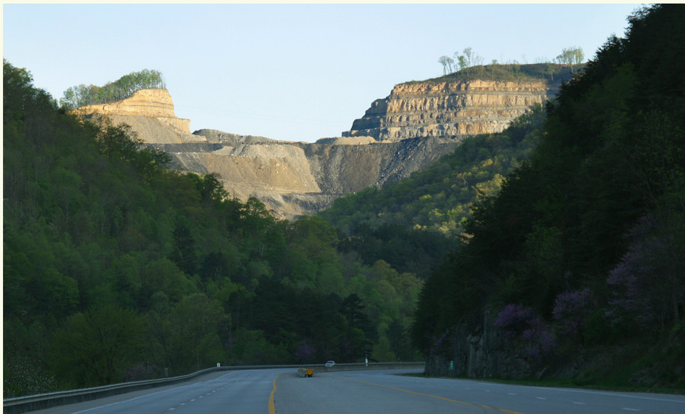
Mountaintop removal mine in Pike County, Kentucky.

Underground Mining. Overall, surface and underground mining have the same level of emissions. The main difference is that surface mining produces more ammonia emissions 28 due to the use of blasting, while underground mining produces more particulate emissions due to the use of limestone (Spath et al., 1999). As mentioned earlier, underground mines produce more methane per unit of production, from twice as much (Spath et al., 1999, p. iv) to six times as much (Spath et al., 1999, Table 52)—though some is captured for use. Additionally, underground mines can result in subsidence—the sudden or gradual collapse of a mine—which can affect water flows and damage housing and infrastructure (Berry et al., 1995; NRC, 2010). Abandoned mines can also suffer from subsidence, as well as mine fires and leakage of mine waste into waterways (NRC, 2010). While Spath et al. (1999) indicates that there is general equality of damages between the two types of mines, the evidence appears to favor strip mines as less damaging to human and environmental health on a per tonnage basis.