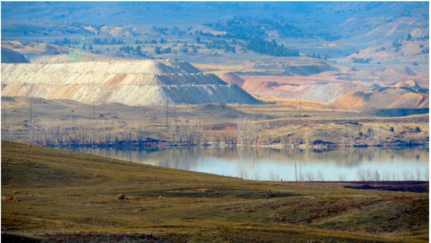
Mining spoils next to the Tongue River Reservoir, which is a popular recreation destination in Montana.

The Mineral Leasing Act of 1920 and Federal Coal Leasing Amendments Act of 1976 require that federal coal leases be offered competitively. 9 However, for decades, BLM has run a noncompetitive program that lacks transparency and oversight, and undervalues coal at a loss to the American taxpayer.