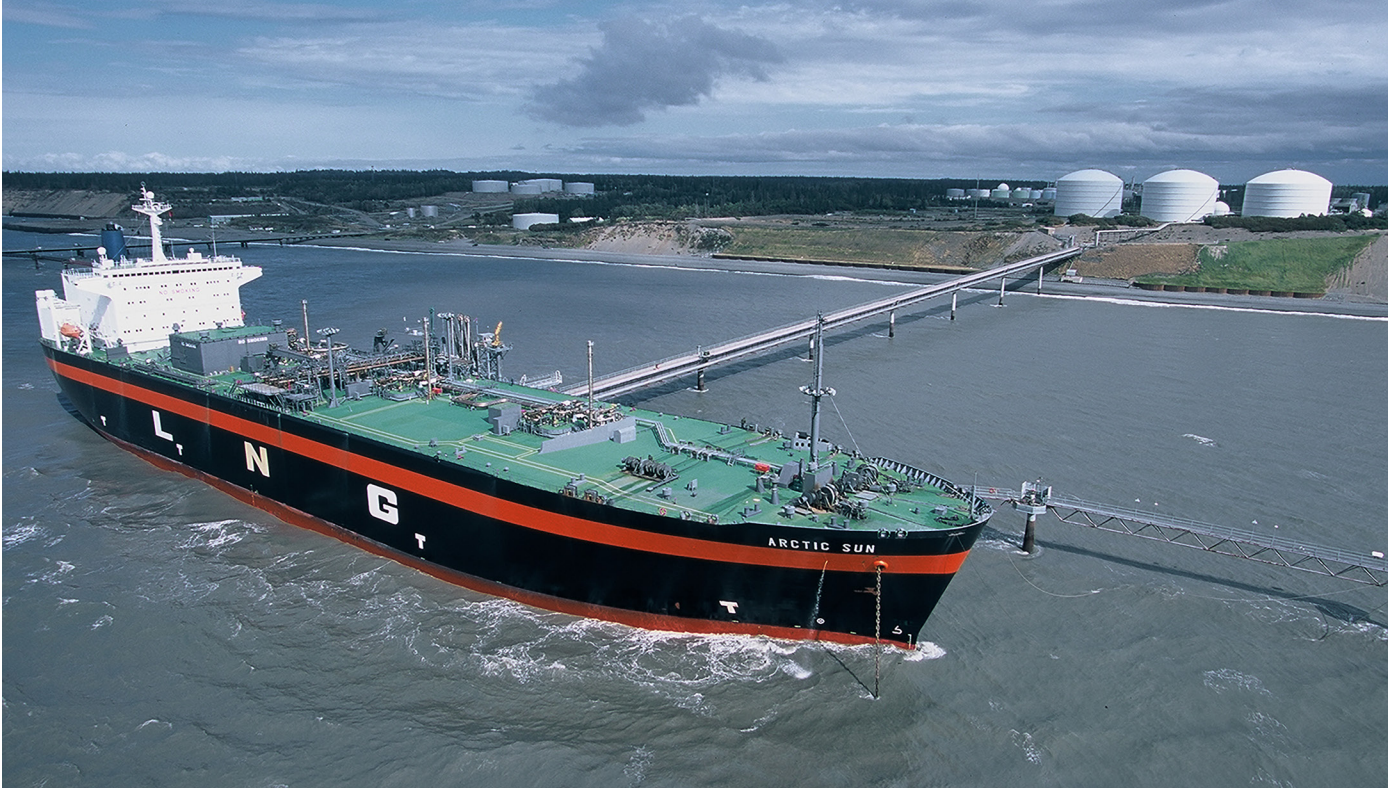
The Kenai LNG Plant in Alaska has exported US LNG to Japan for more than forty years.

Bolivia's production has leveled off as key fields decline and lower gas prices constrain investment.