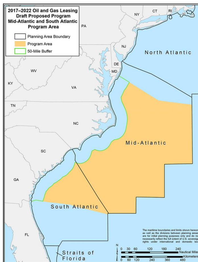
Figure 2. BOEM’s Originally Proposed Program Area for Offshore Oil and Gas Leasing in the Atlantic (subsequently removed from the five-year program)

For both the DPP and PP versions of the 2017-2022 program, BOEM analyzed a variety of factors for the Atlantic region, including the region’s resource potential and infrastructure needs, ecological and safety concerns, competing uses of the areas, and state and local attitudes toward drilling, among others. The initial analysis for the DPP resulted in a planned lease sale in a combined portion of the Mid- and South Atlantic Planning Areas in 2021 ( Figure 2 ). However, after the comment period and further analysis, BOEM removed the Atlantic sale in the PP. BOEM gave several reasons for the removal, including “strong local opposition, conflicts with other ocean uses, ... [and] careful consideration of the comments received from Governors of affected states.” 43 BOEM further cited the broader U.S. energy situation as a factor in its decision not to hold an Atlantic lease sale in the 2017-2022 period. Given growth over the past decade in onshore energy development, BOEM stated, “domestic oil and gas production will remain strong without the additional production from a potential lease sale in the Atlantic.” 44