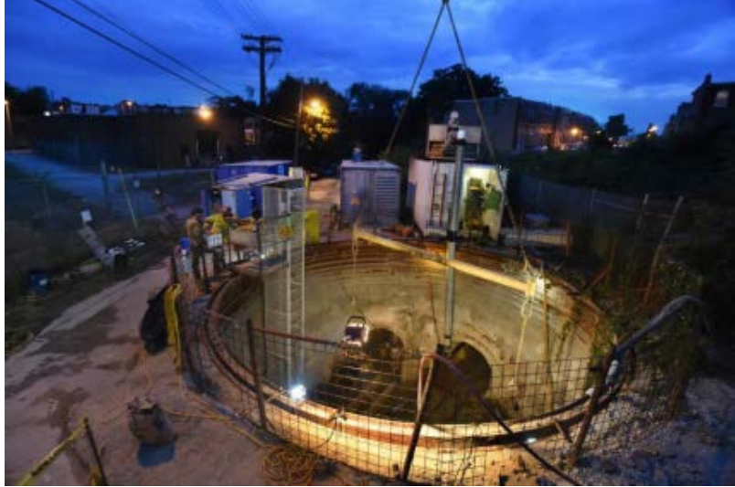
In response to the federal Clean Water Act, dozens of construction and engineering firms are working to fix leaks in Baltimore's sewage system.