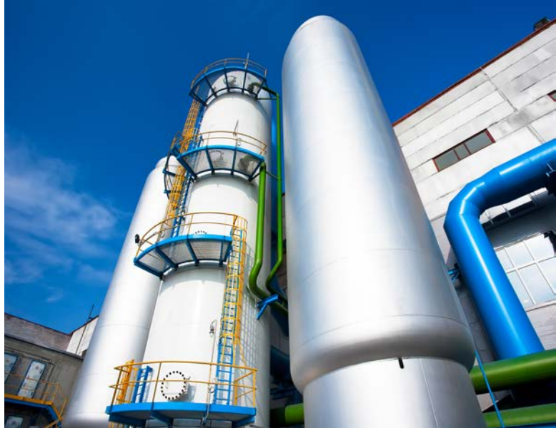
Installations of industrial scrubbers like these and other types of pollution controls have resulted in the creation of thousands of jobs in response to environmental regulations.

estimated to create the equivalent of 167 full-time jobs for 20 years, while a 4-Gigawatt (GW) wind project, including associated transmission infrastructure, was estimated to create the equivalent of 1,500 full-time jobs. 19