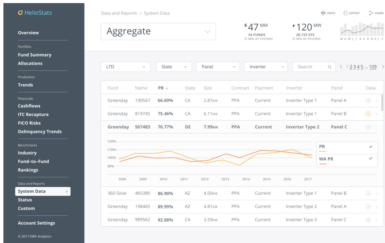
Fig. 3: An example of an asset-level database is the HelioStats Risk Management software by kWh Analytics, Inc.

investors considering working with independent third parties on this service, a reference list of other regulated institutions who are already customers is an important vetting mechanism.