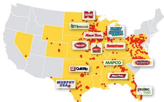
Figure 3: E15 availability as of Sept. 2017, courtesy of Growth Energy .

Today, automotive manufacturers are now moving in greater number towards explicitly approving the use of E15 in owner manuals for new vehicles. The owner manuals of 80 percent of 2017 vehicles approve the use of E15. This includes the 'Big Three' American manufacturers—Chrysler, General Motors, and Ford—as well as Honda, Toyota, Volkswagen Group, and Takata Motors. 11 Both the 2016 BMW X1 and Mini Hardtop (a BMW subsidiary) approve the use of E25 (25 percent ethanol, 75 percent gasoline). 12 As automotive manufacturers design more fuel-efficient vehicles, one can expect this trend of ethanol approval to continue. This is because the next generation of internal combustion engines use smaller, more efficient engines, which require higher-octane fuels; currently ethanol is the cheapest, cleanest source of octane.